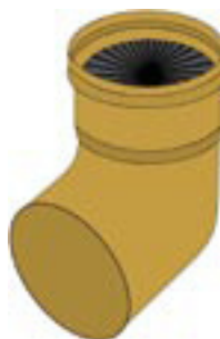
End cap combined made of PE-PP with outlet DN 70/100, Type 01